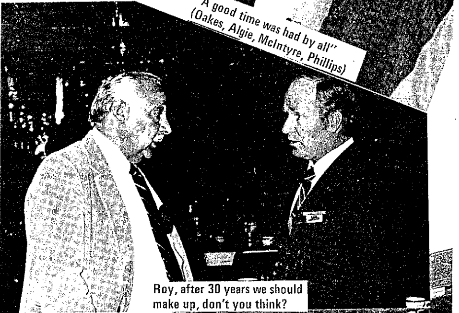
Roy, after 30 years we should make up, don't you think?