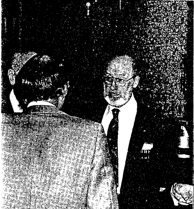
Charlie, I swear, the thing blew off on the way over here.