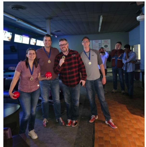
Winners, Team Ainsworth! (with runner ups pictured in back)